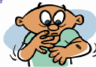
SLOW HEALING WOUNDS

HIGH BLOOD GLUCOSE MAY LEAD TO A MEDICAL EMERGENCY IF NOT TREATED.