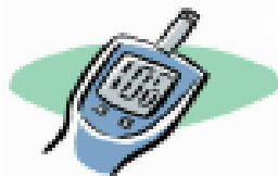
CHECK BLOOD GLUCOSE

If your blood glucose levels are higher than your goal for three days and you don't know why,