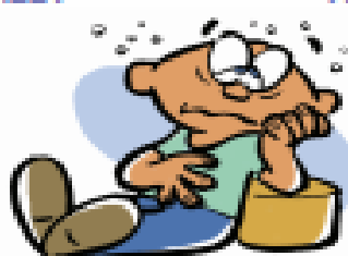
WEAKNESS OR FATIGUE